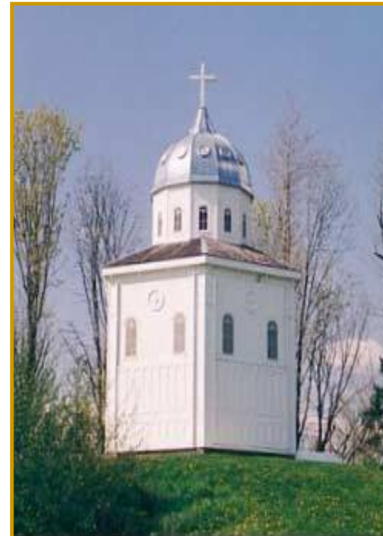
The New Grotto

Office hours: 9:00 am – 4:30 pm on Mon., Tues., Thu., & Friday; CLOSED on Wed. & weekends